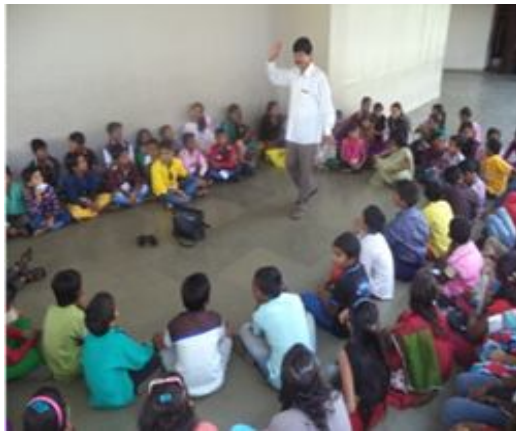
Visit to Nehru Planetarium

Many other events were undertaken by BASS. Awareness on Child Labour was created on the Anti-Child Labour Day (August 30, 2013). The Child Rights Week (November 14 to 20, 2013) was held on the issue of Child Sexual Abuse. More than 750 people were reached through this event. The school enrolment campaign, 'Back to School', was initiated on June 12, 2014 to ensure every child is in school rather than at work.