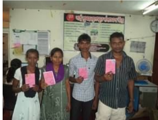
Ration cards provided to members through BFSC