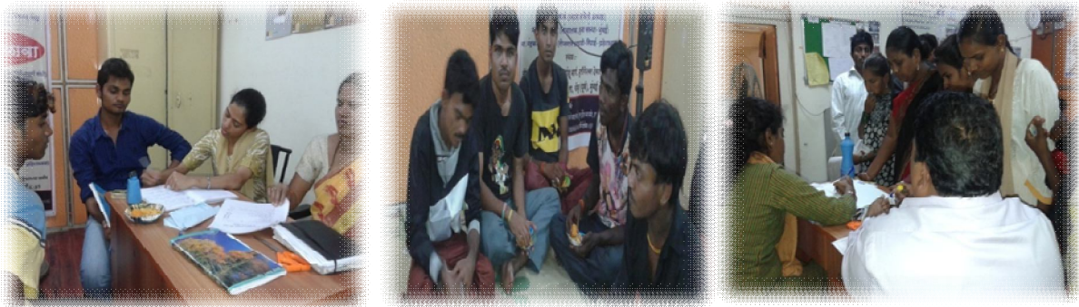
Photographs taken at the Job Fair organised for youth

A lot of work has been done to make employment opportunities and placements available for the youth. Exposure visit for the youth was undertaken to a mall to show them how businesses are undertaken and the tremendous employment opportunities that are available in such business centres. A job fair was organised for unemployed youth from slums and pavements. 861 youth attended this fair and 621 were short listed. A follow-up was undertaken with 18 companies and all the short listed youth. Four of the youth had started working whereas few others did not join the companies due to the working criteria and far away destination of the work. Due to this job fair, many youth are approaching the Yuva Rojgar Prashikshan and Kaushalya Vikas Kendra for employment opportunities. Job counselling and referrals have been provided to 103 youth in various organisations for jobs such as logistics, courier services, housekeeping, data entry and marketing. Nine of the youth are working in these roles. Linkages have been undertaken with various organisations for undertaking trainings for the youth. These include I Colour Foundation, Pahaydan, Nirman, I Lead Centre, Info Computer Institutes, Kanya Beauty Parlour, etc. Trainings are being planned for the youth to increase their employability skills. More than 48 youth are currently availing trainings from these organisations.