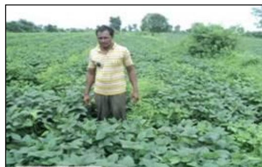
Demonstration of Soybean crop

Various agro-allied interventions and Small and Medium Enterprises (SMEs) are now being undertaken by the farmers. The SHGs and JLGs have received loans from Bank of India, RYK, Government line departments and NABARD for undertaking these allied livelihoods.