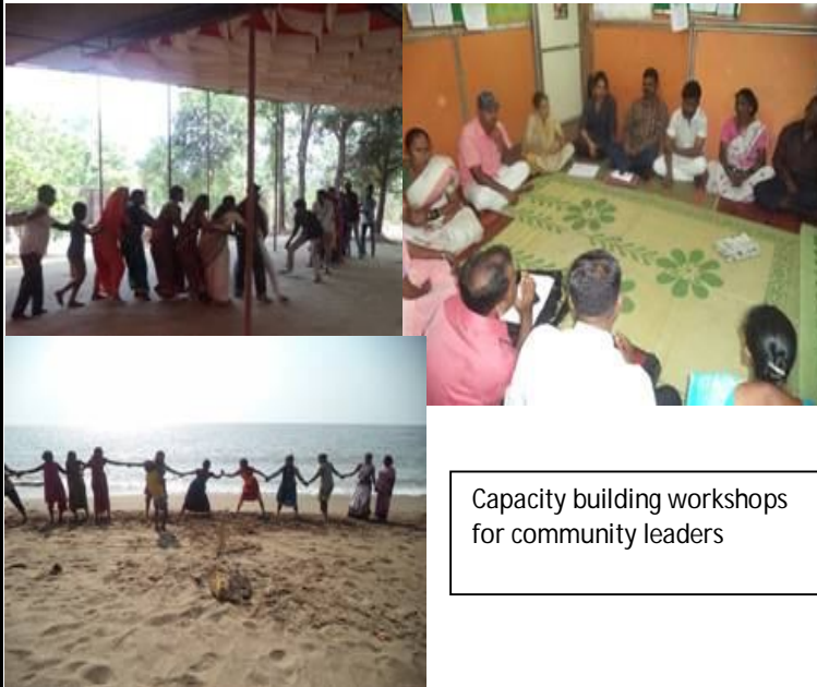
Capacity building workshops for community leaders

advocating for solving community issues, etc.