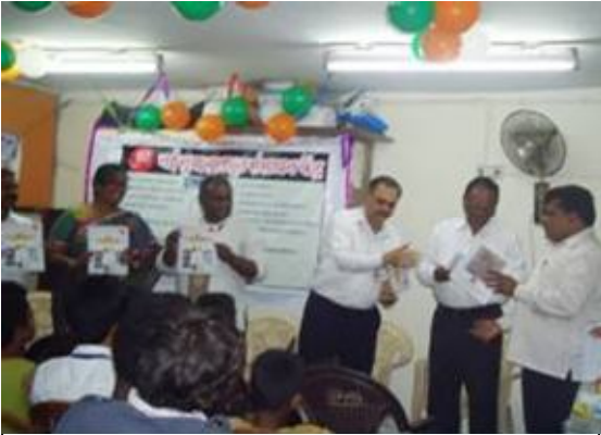
Inauguration of BFSC at Dadar