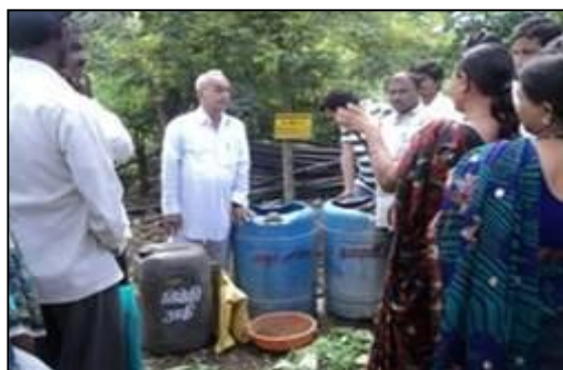
Training on LEISA techniques for farmers

usage of solar energy, motor rewinding and tailoring have been provided to 60 individuals. With the help of these trainings, five people have started their own business and are earning additional profits of Rs. 4000 per month. Out of the 118 SHGs in the villages of Barshitakli, 37 SHGs have participated in different entrepreneurship activities.