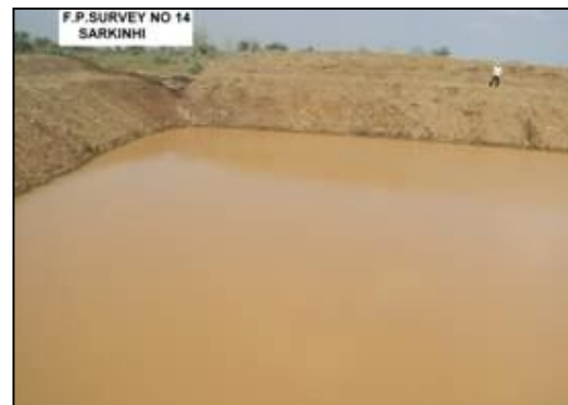
Farm Pond in Barshitakli block

During the year, 17 farmer Producer Groups (PGs) were formed in Barshtakli block through which 217 farmers came together and were made aware of collective marketing strategies and practices. Market linkages have been successfully established with Anant Seeds, Jindal Pvt. Ltd. and Mark Agri Genetics Pvt. Ltd. In Deoli, 120 bags of Soybean seeds were provided to 26 farmers through linkages with Mark Agri Genetics Pvt. Ltd. for development of seed plots. Expert advice was given to the farmers about pests and diseases along with the Package of Practices (PoPs). Farmers were able to increase their yield from seven quintals per acre to 11 quintals per acre. Through market linkages, farmers were also given Rs. 100 as bonus per quintal along with transportation costs of Rs. 75 per quintal. This helped in increasing their overall income and profits.