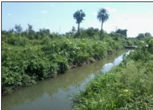
Cement Nala Bund (CNB) in Deoli block

Water conservation and irrigation measures have been facilitated for the farmers in the form of drip irrigation, sprinkle irrigation, farm ponds, MGNREGA wells, pump sets, etc. This has resulted in water conservation by up to 30%. In-situ water conservation has been done with the construction of farm bunding on 1150 farms in Deoli, 52 farm ponds (10 in Barshitakli and 42 in Deoli), 18 Cement Nala Bunds (CNB) (14 in Barshitakli and four in Deoli), and five Nala Bunding (one in Barshitakli and four in Deoli). This has been done under the schemes of the Government and with the support of the International Fund for Agricultural Development (IFAD).