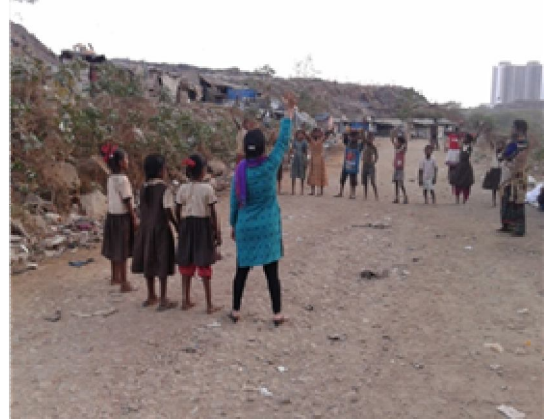
Activities with children living on the streets

YUVA Urban has also been working with street children and facilitating their groups. During the year, the organisation has facilitated the formation of 15 groups of street children in the areas of Kurla, Mahim, Ray Road station, Dadar station, Mulund, Goregaon, Borivali, Kandivali and Wadala. A total of 171 children have participated in 15 meetings organised through these groups. The children have been given information on CHILDLINE and Nai Subah and also about their basic rights and entitlements. Games were organised with them to inculcate values. Cricket kits have been distributed to some of the children's groups. Various activities such as sports, drawing and story telling sessions, paper activities, movie screening, etc. are undertaken for the children and through these, different values like honesty, loyalty, relationship, togetherness and unity are inculcated amongst the children.