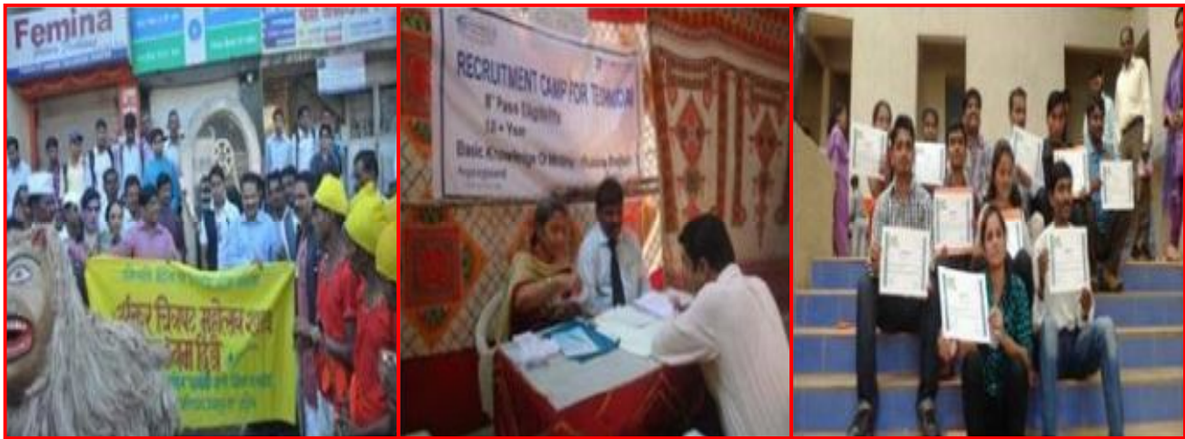
Ankur Film Festival on Community Media

members were sent for State and National level events. The youth participated in six such events in Gujarat, New Delhi, Orissa, Mumbai, and Nagpur.